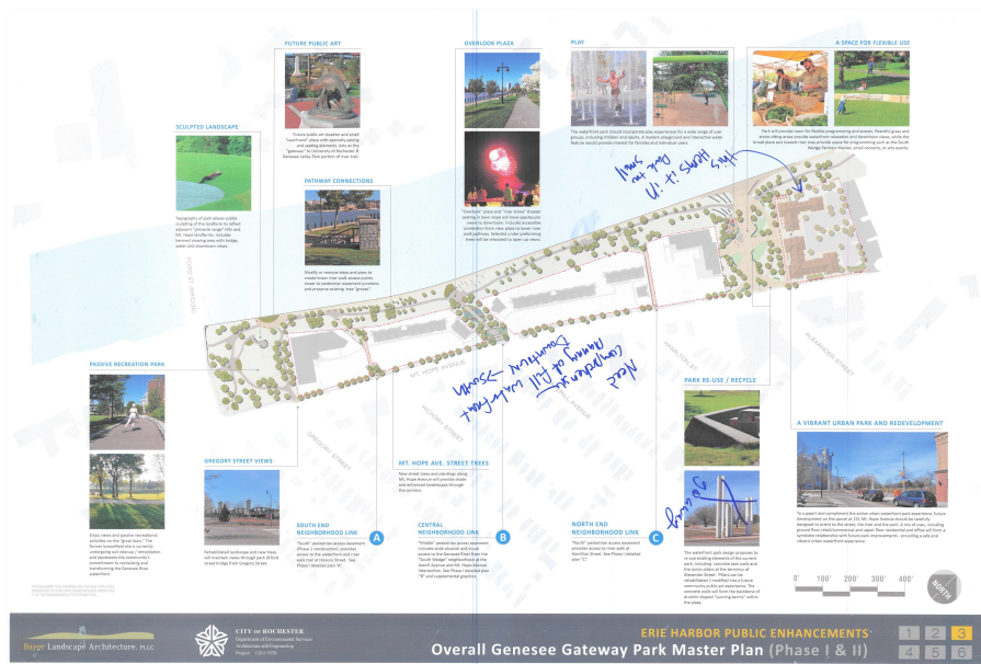
Board #2: Map with precedent images