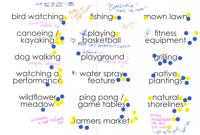
Board #3: Board with phrases and words about potential park features