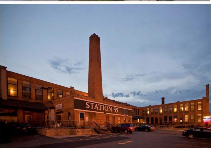
Eyesore no more! The Station 55 complex at 55 Railroad Street in 2000 (above) and today.

As recently as last decade, Railroad Street leading into the Market from East Main was in pretty rough shape. The building at 55 Railroad Street was actually torched by an arsonist around 2001, leaving an eerie shell as seen here. Thanks to the vision and commitment of Constanza Enterprises, the shell was transformed in 2009 into a gorgeous mix of residential units and office/commercial space—all of which is in high demand today. Railroad Street's revitalization is proof that business, citizens, and government together can accomplish extraordinary things!