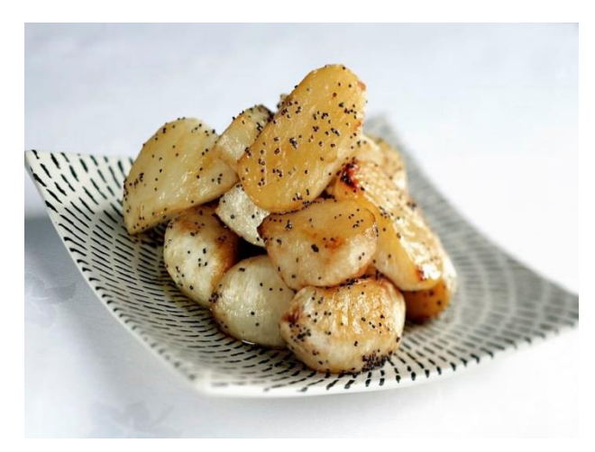
Turnips (yes, turnips!) are local veggies available at Market this time of year, and can be turned into tasty and healthy dishes such as this roasted version.

We're far removed now from the end of last year's growing and harvest season, but there are still plenty of local vegetables and fruits available at the Market—varieties that can be cultivated and harvested late into the calendar year, and stored well over the winter. Here's local produce you get at Market in March and April: