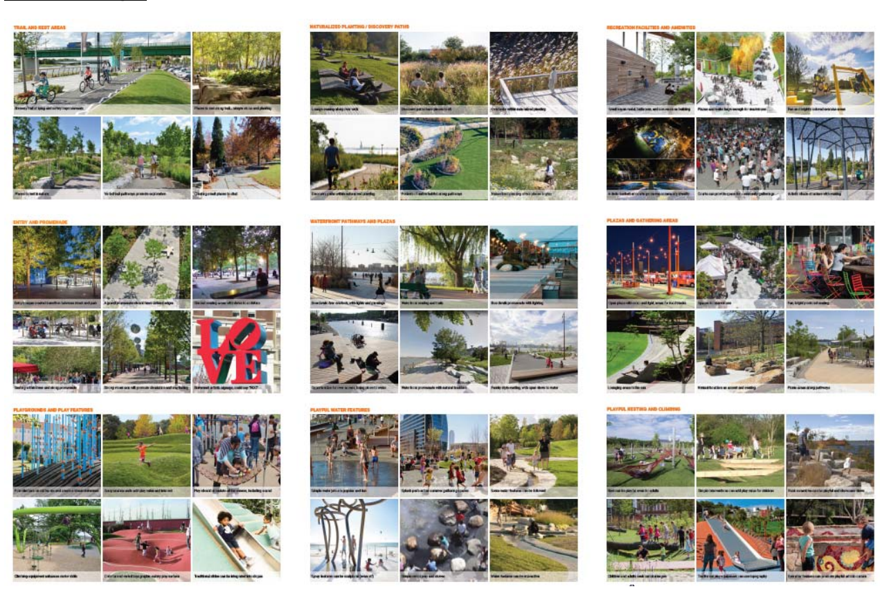
Image: "Playful water features" - This would be awesome for the back of our (the Hamilton) building

Image: "Simple mist spray and stone" - great!