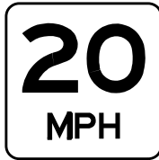
W13-1p 18" x 18"