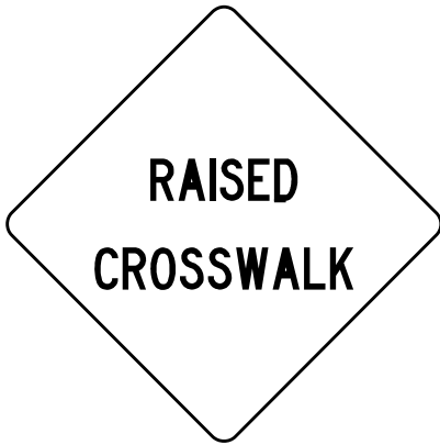
W17-1 30" x 30"