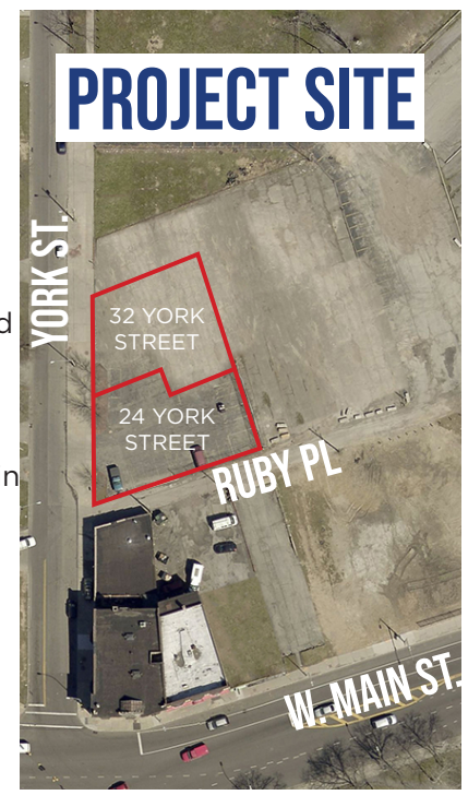
The project site is located in the Bull's Head Neighborhood north of West Main Street and north of St. Mary's Hospital.