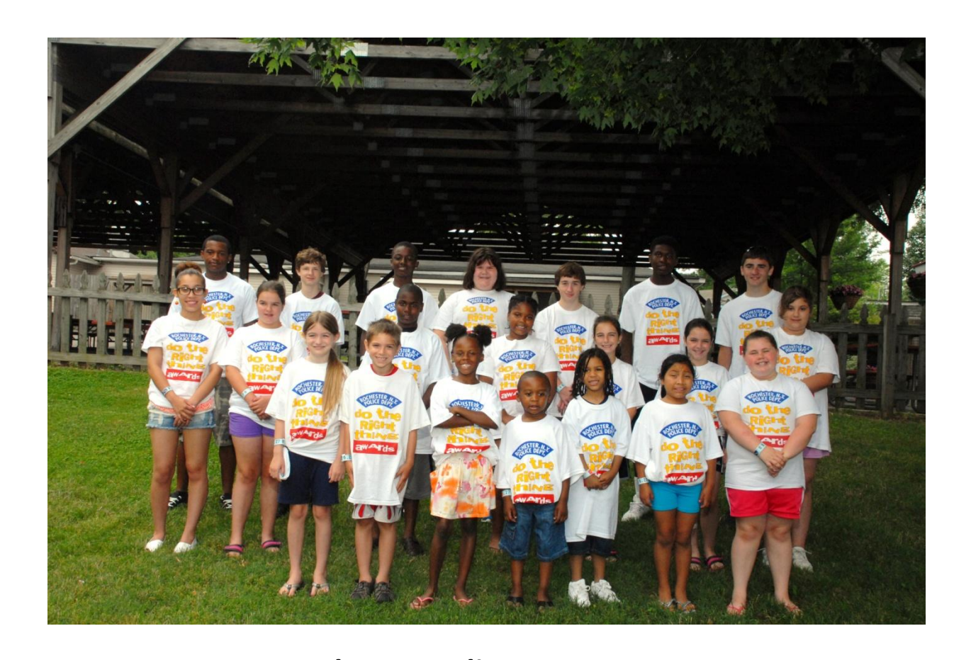
Rochester Police Department

185 Exchange Boulevard, Rochester, New York, 14614