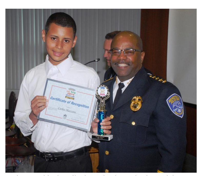
projects and is described as a leader and role model.