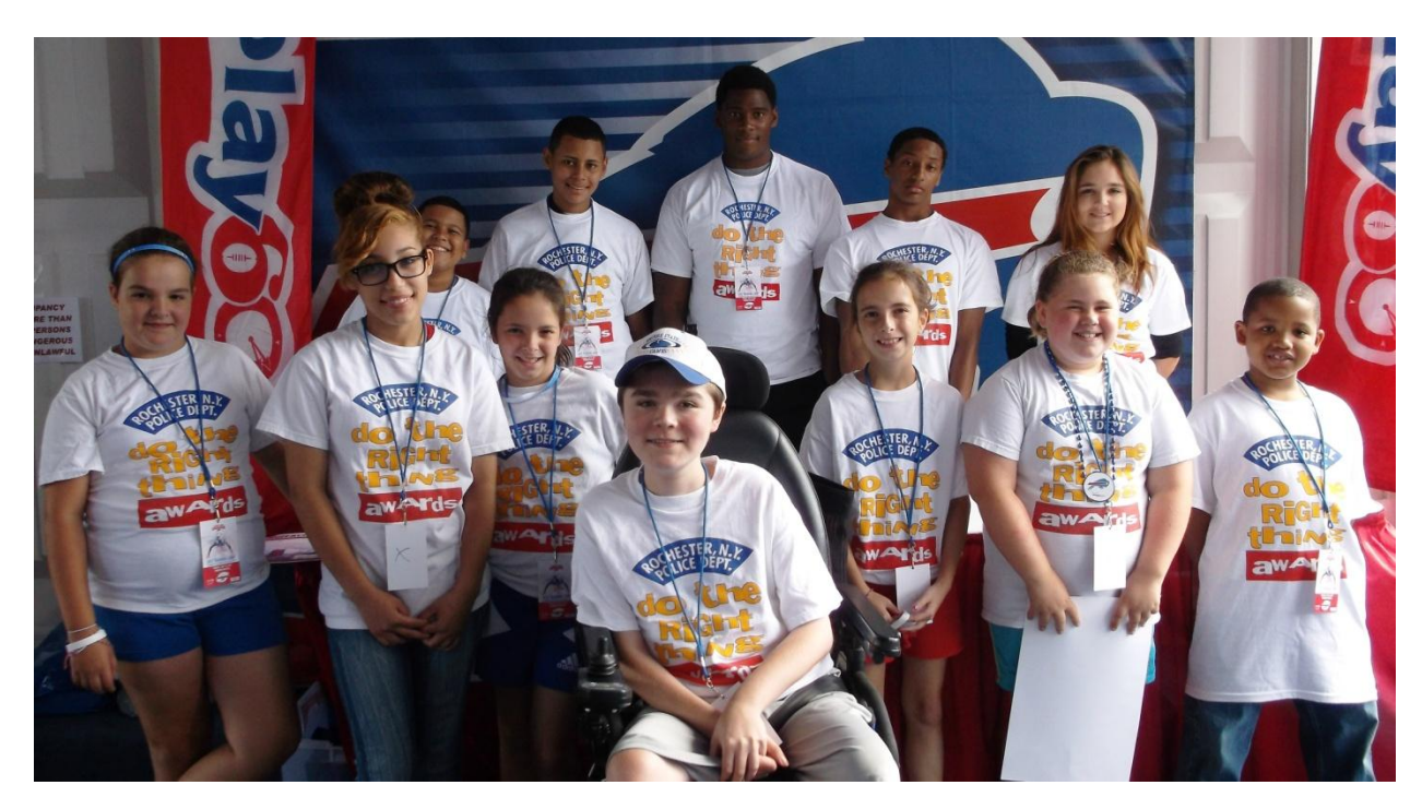
This year's Do The Right Thing winners were given the VIP treatment during a trip to the Buffalo Bills Training Camp on July 30, 2013. Thank you, Buffalo Bills!!!!!!