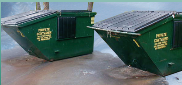
Yes: Proper access for refuse pickup