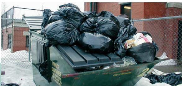
No: Overloaded and access unavailable for pickup

Curb service customers: DO NOT place containers on top of snow banks, in the street or on the sidewalk, where they might hamper traffic and snow removal activities.