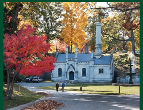
Mount Hope Cemetery