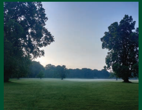
Genesee Valley Park*