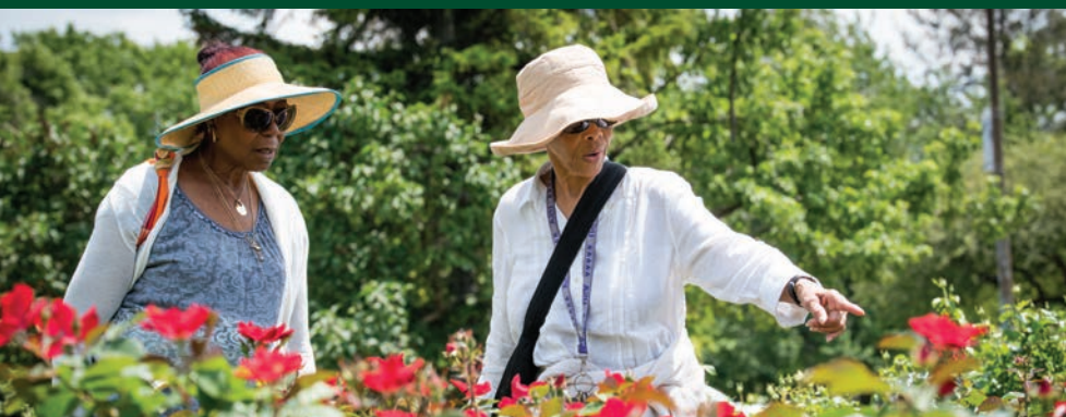
Maplewood Rose Garden*