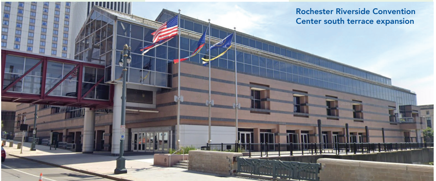
Rochester Riverside Convention Center south terrace expansion