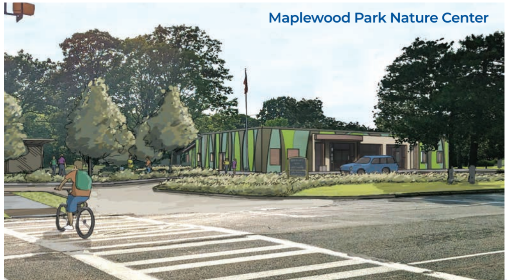
Maplewood Park Nature Center