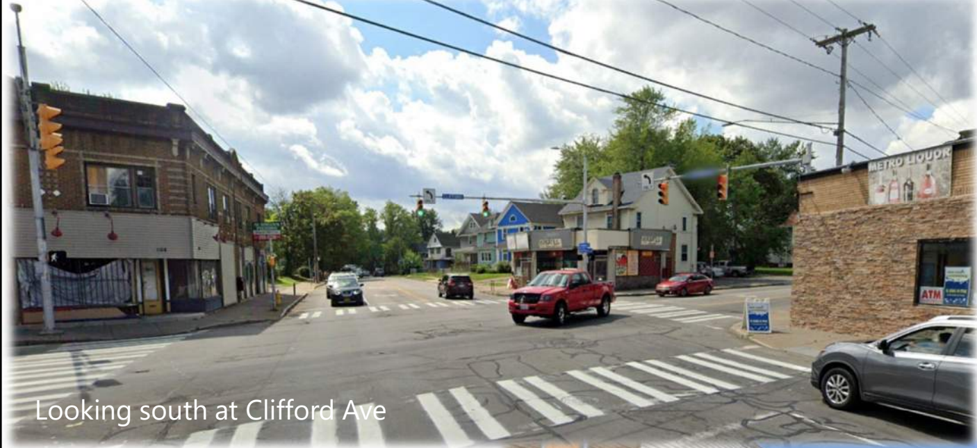
Looking south at Clifford Ave