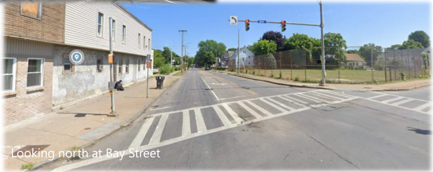
Looking north at Bay Street