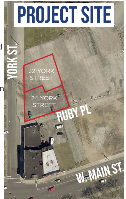
The project site is located in the Bull's Head Neighborhood north of West Main Street and north of St. Mary's Hospital.

The City of Rochester was awarded a United States Environmental Protection Agency (U.S. EPA) Cleanup Grant to remediate the site. In addition to funding received from the U.S. EPA, this project will be funded by the City.