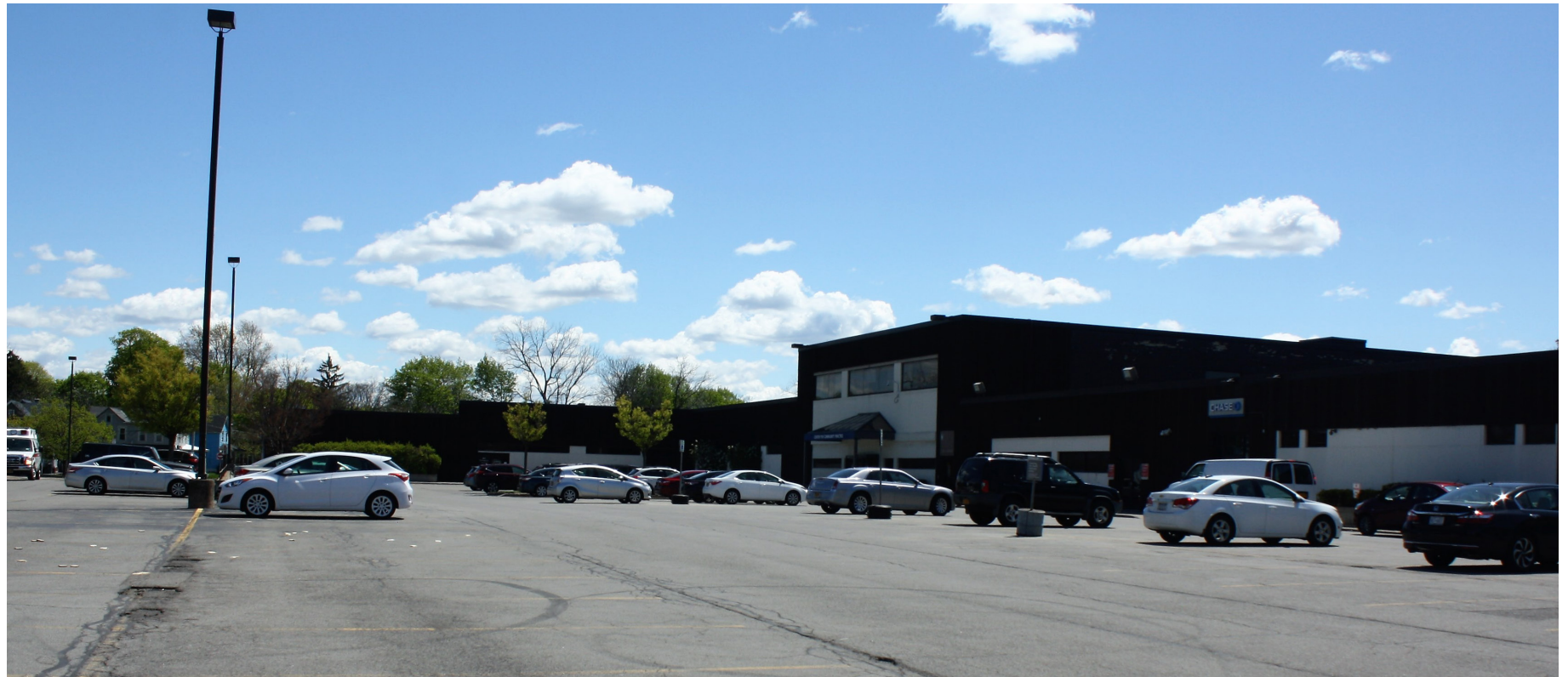
Bull's Head Plaza parking lot could be a potential site for a Bull's Head Community Resource Center.

renovation of Michigan Central Station and several other buildings in the neighborhood in an effort to create an innovation hub to explore the future of transportation. Located in one of these buildings is the Michigan Central Station Information Center, which provides project and construction updates, serving as a place for community members to share feedback and learn about upcoming events and activities associated with the development.