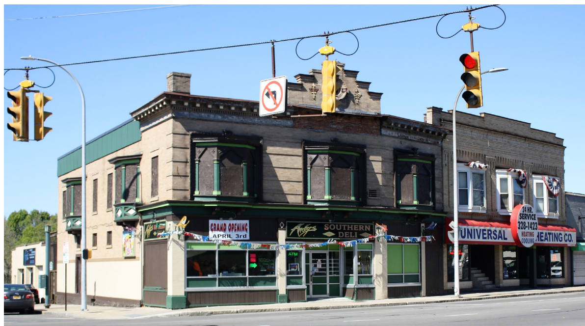
Businesses in Bull's Head.

Recognizing the challenges of converting plans into action, the panel provided high-level implementation strategies and an approach that focuses on the completion of actions in the short, medium, and long terms to establish a shared vision for Bull's Head and make it a reality.