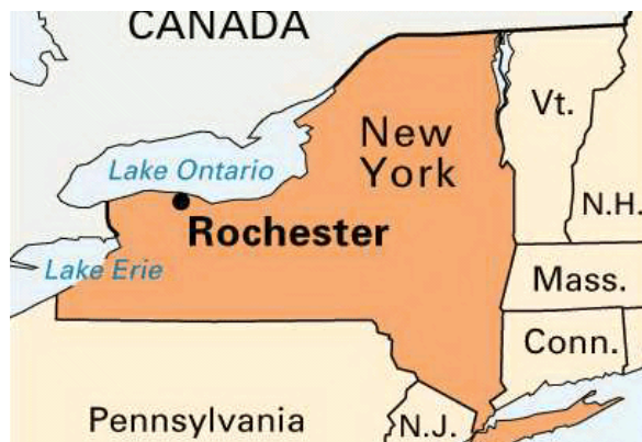
Rochester sits on the banks of Lake Ontario.

However, since 1950 the city has experienced a decline in population from about 350,000 to an estimated 205,695, according to 2020 U.S. Census data. The milling industry is no longer a major contributor to the economy, and the major employers mentioned here have notably downsized their operations since the 1980s. Today the top three employers in the area are the University of Rochester, Rochester Regional Health, and Wegmans.