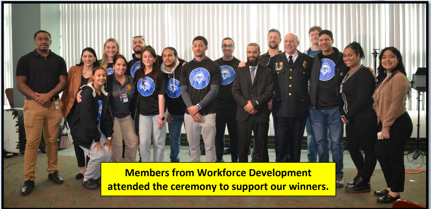
Members from Workforce Development attended the ceremony to support our winners.