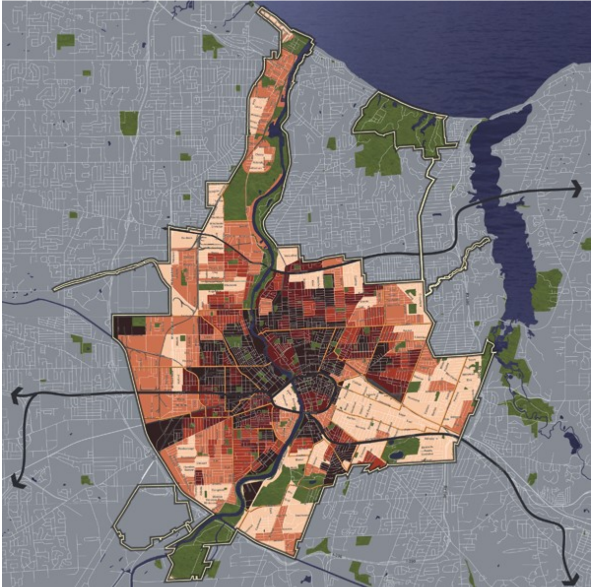
2006: Percent of Families living in poverty