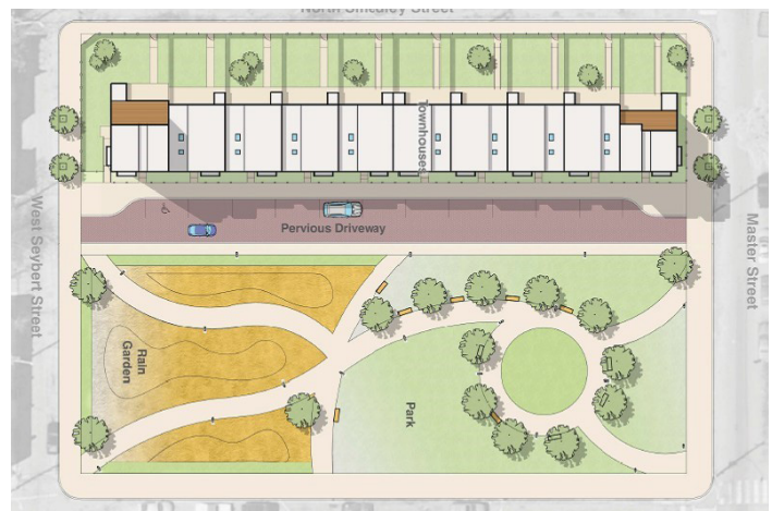
Typical Green Parks Program

The stormwater management system features utilized porous pavement surfaces, a bioswale, and three hydraulically-connected rain gardens with subsurface storage. The systems manage runoff from approximately two (2) acres of the park and adjacent street network.